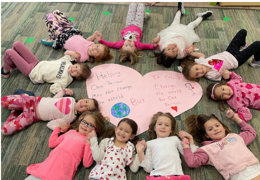
Students at Jeffers Pond Elementary created a poster: "Helping one person may not change the world, but it could change the world for one person."

From making friendship bracelets, painting hearts, creating kindness bookmarks, assembling folded heart pockets, writing cards and posters, delivering cards to local Veterans and wearing positivity shirts, students were definitely feeling the love!