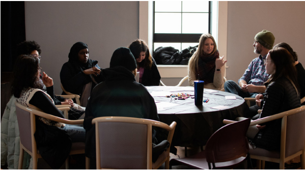
Prior Lake-Savage Area Schools partnered with Jordan Public Schools and Shakopee Public Schools for the annual Caring and Committed Conversations event

Prior Lake High School and Bridges students recently focused on the topic, "The Purpose of School." Students studied the mission of the federal and state education departments and talked about how each individual student can get the most out of the investment their community makes by showing up to school every day, striving to reach their full potential.